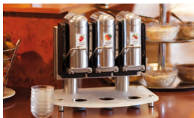
W 36.5cm, H 33cm, D 29cm