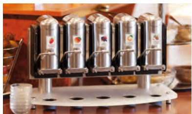
W 55cm, H 33cm, D29cm