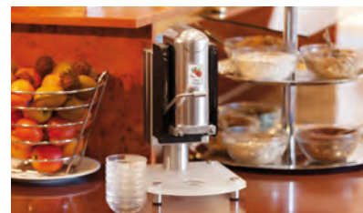
W 20cm, H 33cm, D 29cm